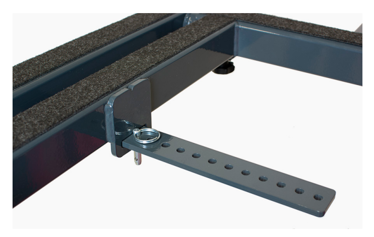
FIG. 1: SAFETY SPLINTER WITH PIN INSTALLED

1. Follow the same procedure as Side Extensions.