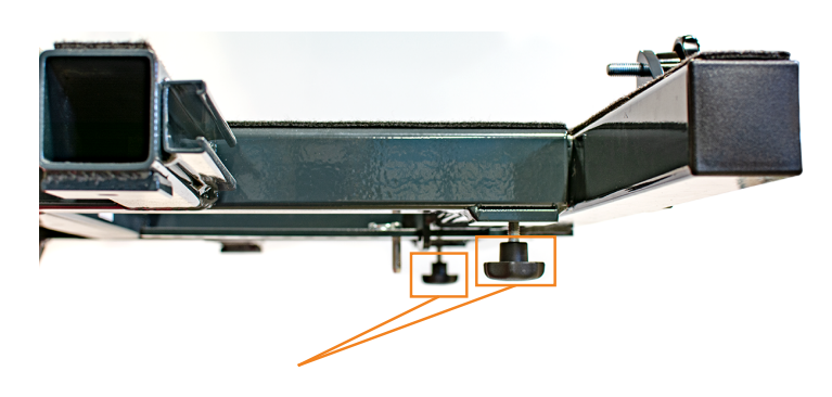
FIG. 2: STAR KNOBS