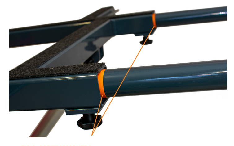
FIG.3: SAFETY MARKERS